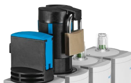
Lockable regulators available with the Festo MS Series lockable regulators.