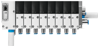
The Festo Motion Terminal VTEM.