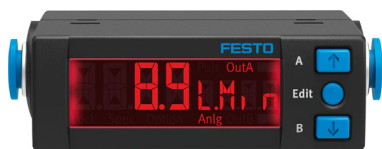
The Festo flow sensor SFAH

Of course, automatic process adjustments are not always possible. If you do need to make a manual adjustment, we recommend using a numerical scale to ensure the adjustments are consistent. For example, look for flow control components with position markings or digital flow meters: the GRLSA one-way flow control valve includes a labeled adjustment ring, while SFAH, SFAB and SFAM flow sensors feature an integrated display, ensuring you achieve your desired flow rate.