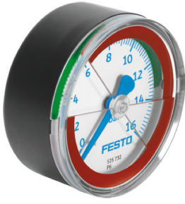
The Festo MA-RG pressure gauge

Similarly, MS Series components, which include pressure regulators, ON/OFF valves, soft-start valves, pressure sensors and flow sensors, feature an integrated red and green scale that displays the output pressure. SFAM flow sensors, for example, feature an illuminating display that turns red, indicating when the flow is out of the desired range.